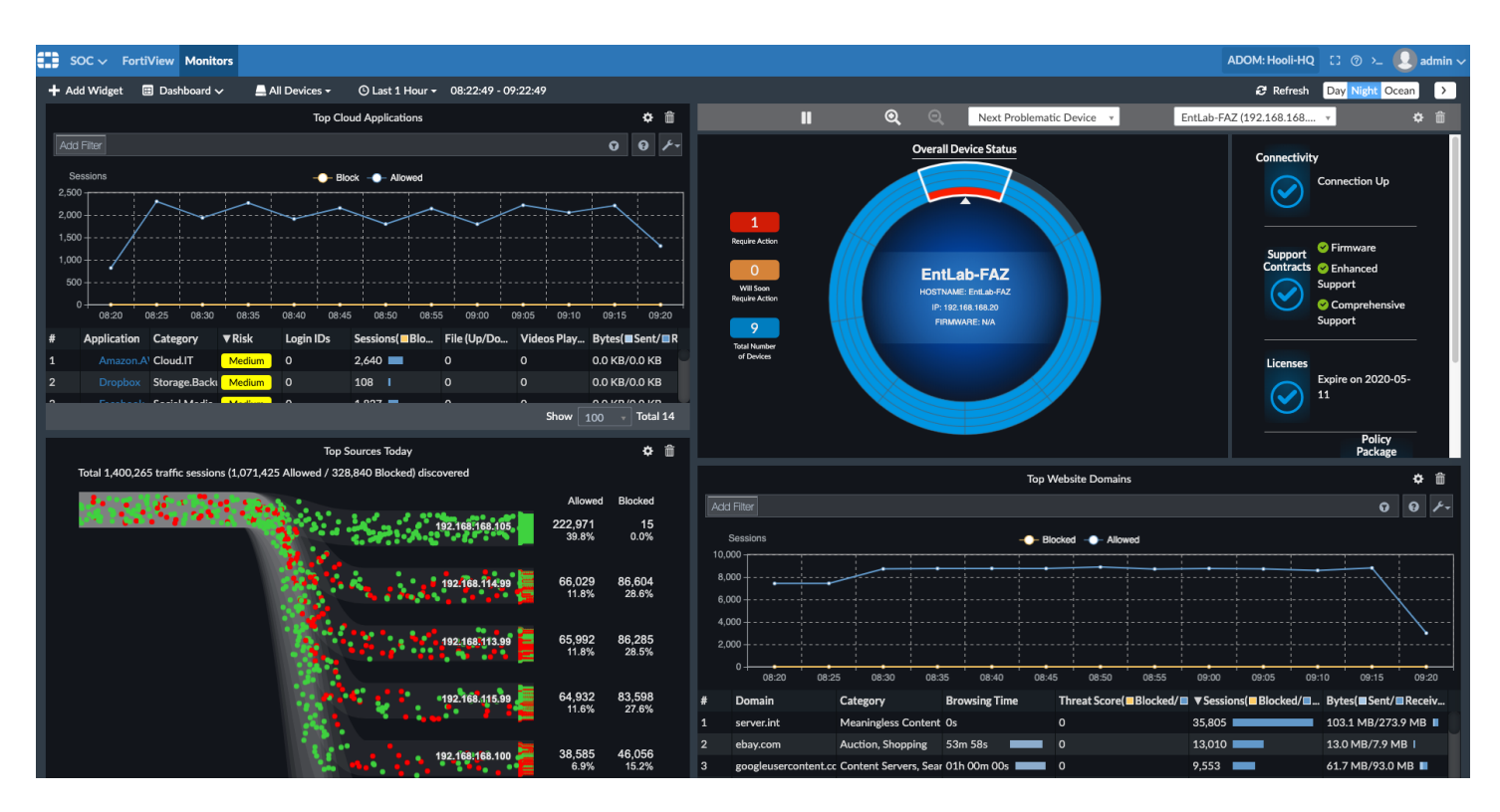
Figure 3: FortiManager dashboard view

The unique single-platform approach of the Fortinet NGFW, which includes flexible deployment options, delivers end-to-end protection that is easy to buy, deploy, and manage. Centralized security management and visibility consolidates multiple management consoles into a single pane of glass and unlocks automation-driven management. Specifically, a highly intuitive view of applications, users, devices, threats, cloud service usage,` and deep inspection gives network engineering and operations leaders a better sense of what is happening on their network. With this strategic view, they can easily create and manage more granular policies designed to optimize security and network resources.